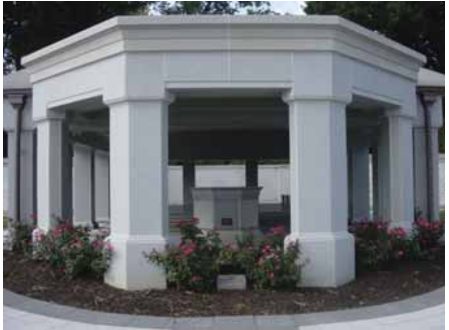
Naval Academy Columbarium