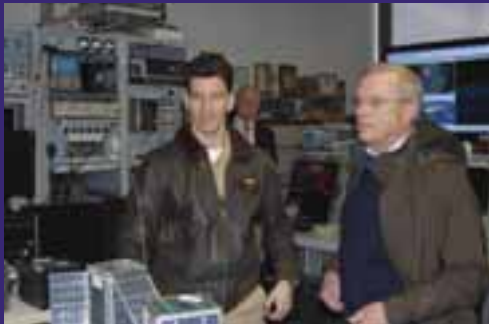
Dr. Bradford W. Parkinson '57 meets with the Naval Academy team working on ParkinsonSAT, a midshipmen-built satellite named in his honor.

This spring, Dr. Bradford W. Parkinson '57 was honored with the 2011 U.S. Naval Academy Alumni Association Distinguished Graduate Award for a lifetime of service.