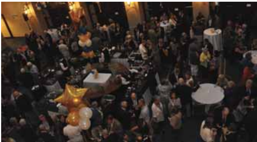
"Anchors Aweigh" reception during the 2011 President's Circle Weekend.

Every fall, President's Circle donors are recognized for their generous support of the Naval Academy and Brigade of Midshipmen at a special event. The weekend of 29 September through 1 October marked the 17th annual President's Circle Weekend, as 350 donors returned to Annapolis to network with one another; mingle with midshipmen, Academy and Foundation leaders; and, of course, watch Navy and Air Force battle it out on the football field.