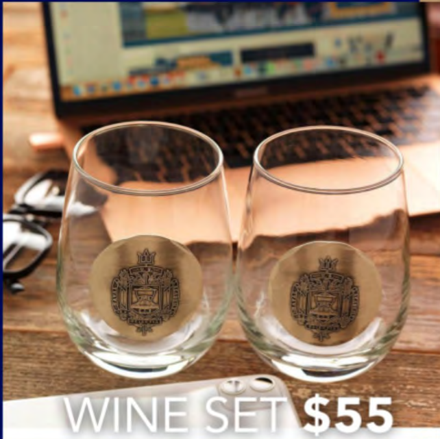
WINE SET $55