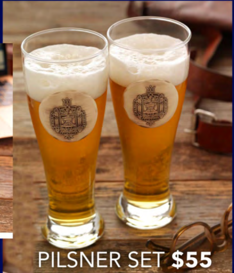
PILSNER SET $55