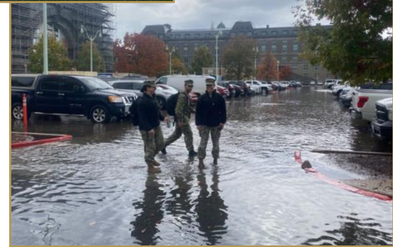
OCT 30 Flooding