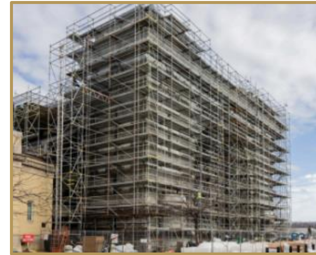
MacDonough Hall EDC: Fall 2026