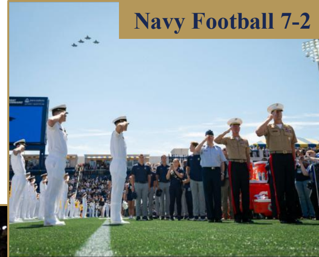
Navy Football 7-2