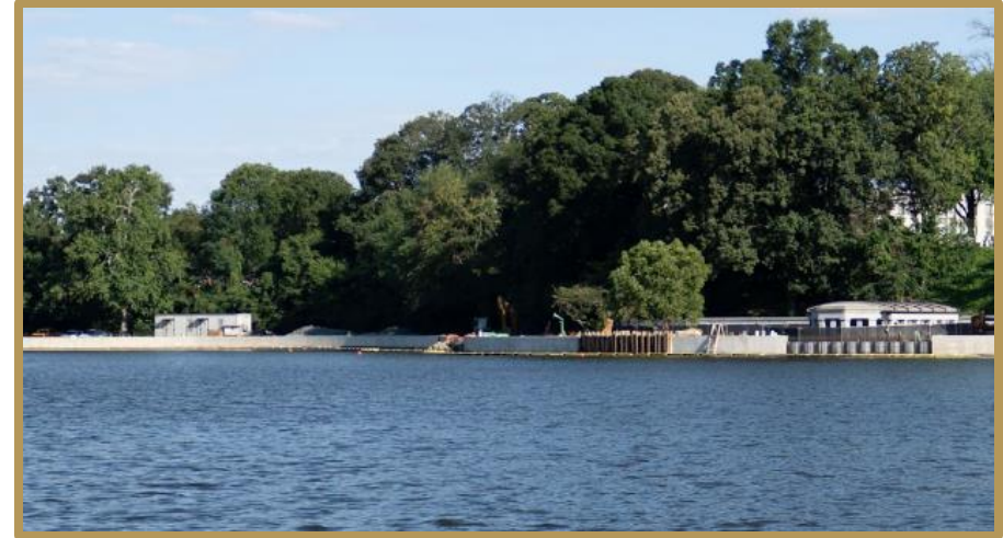
Ramsay Road EDC: Fall 2026