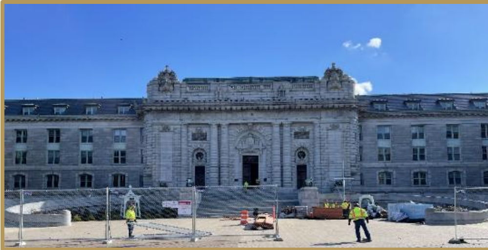
Bancroft Hall Center Section EDC: Spring 2026