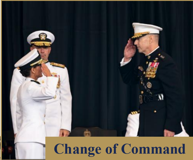
Change of Command