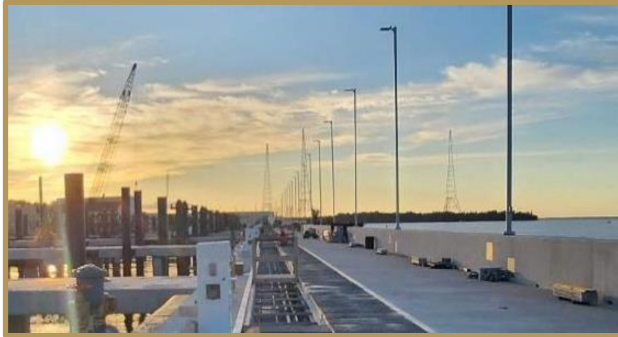
YP Pier Reconstruction Complete