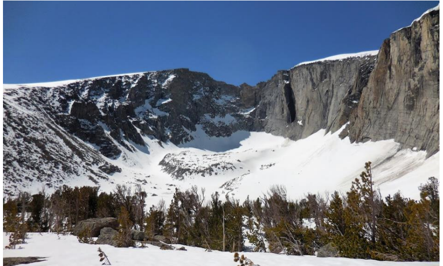
NOLS Wyoming Backpacking